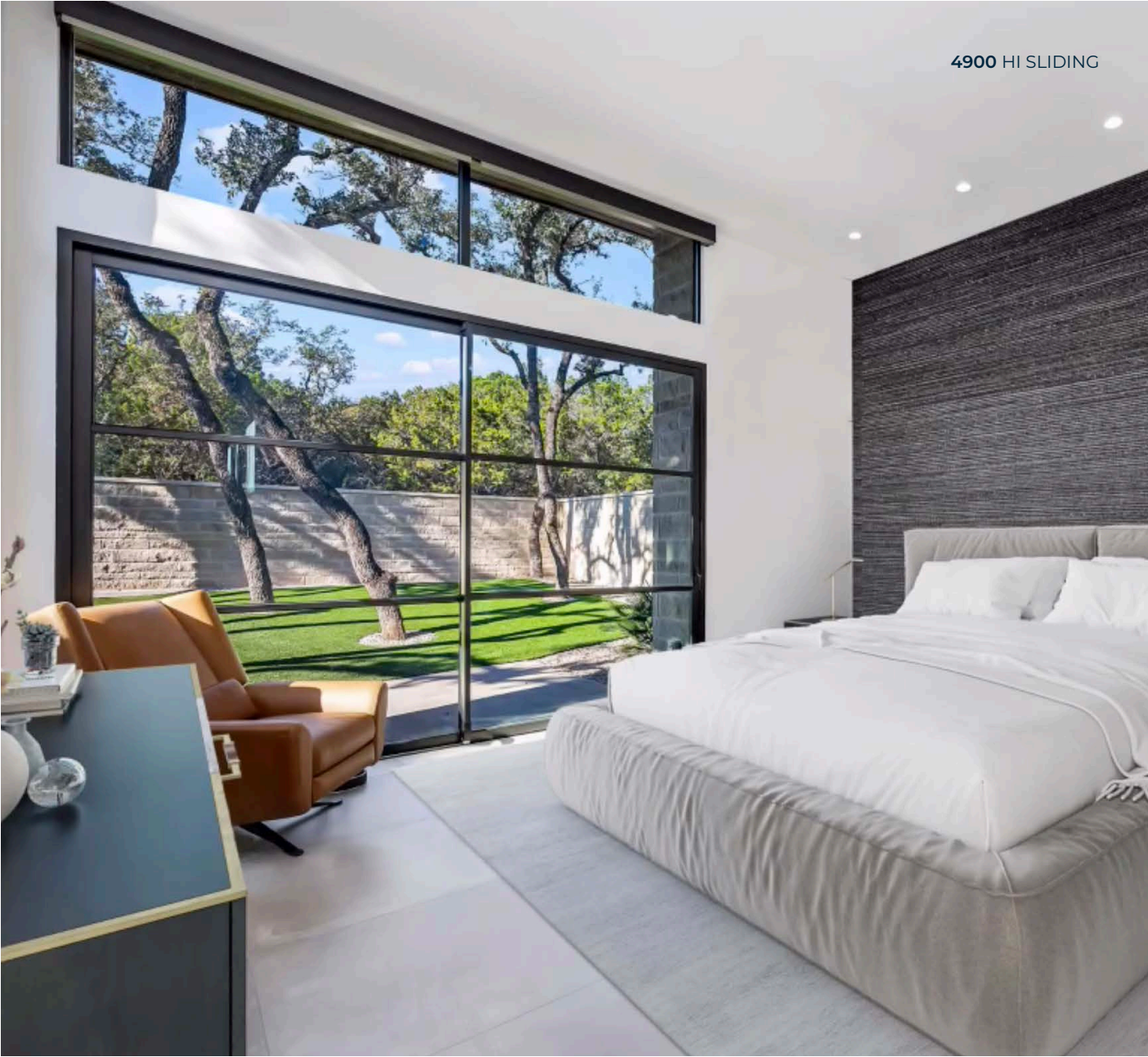
4900 HI SLIDING